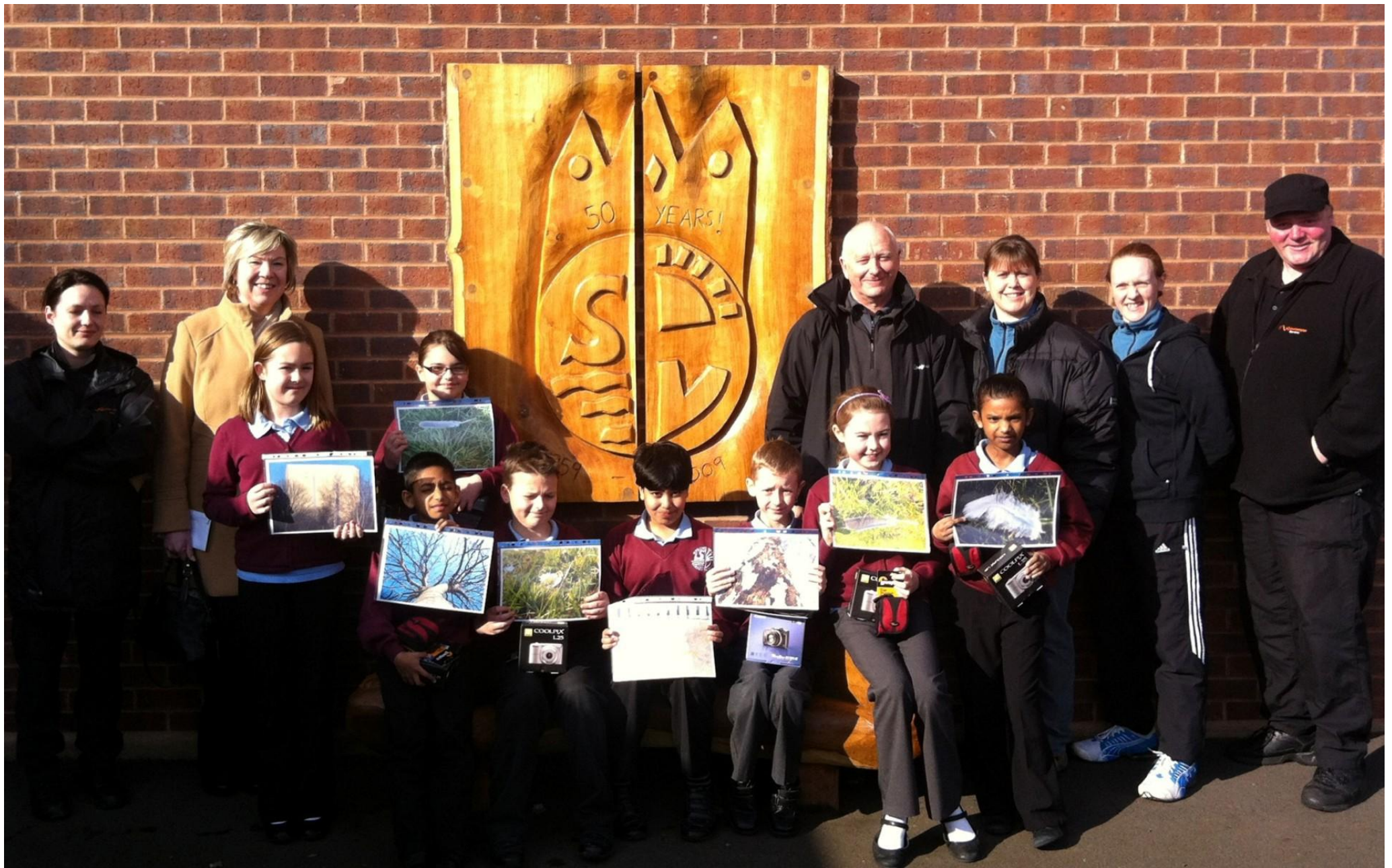
Line-Up of the Photo Competition Winners with the Organisers (two children – Competition Winners - not in school today), so they don't even know they have Won yet! What a lovely surprise for them upon their return.